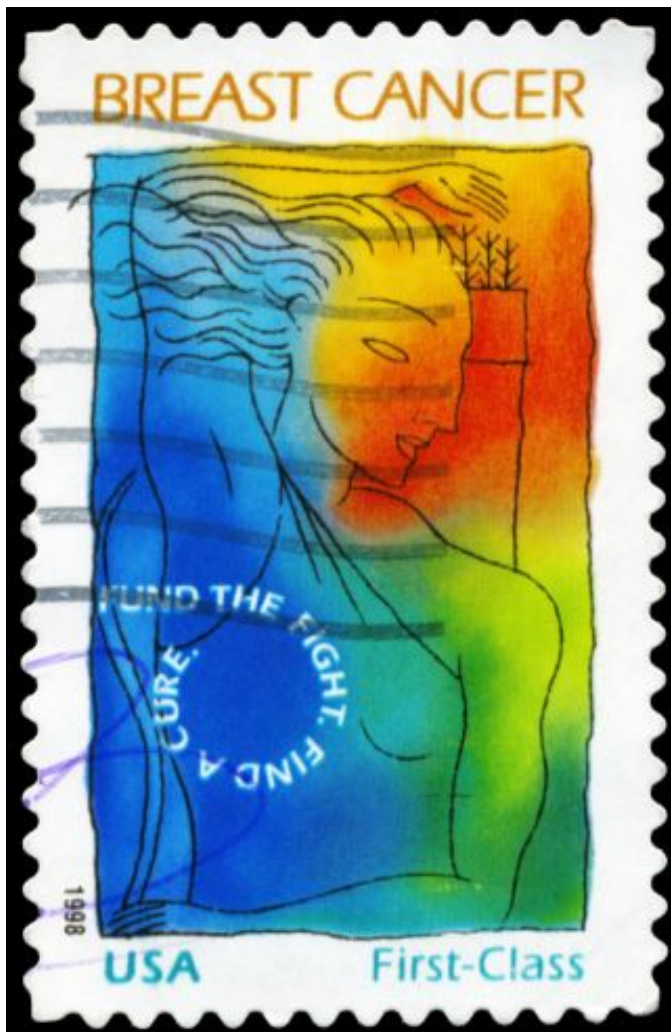
Excessive weight is a risk factor for postmenopausal breast cancer